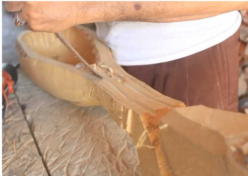
Pak ZAROTTI (Bangka) , while hollowing the neck.