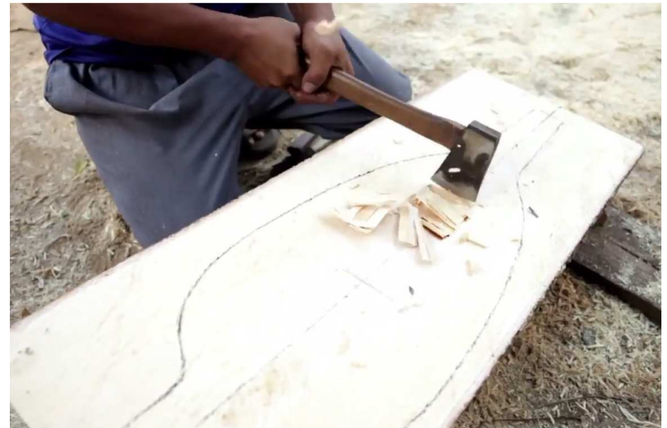
The composite / wide bodied soundbox by maker KUSYADI in Desa Namang, central Bangka.