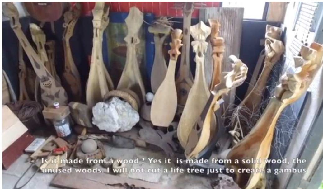
Workshop of Usni MARIOSHA (Belitung Isl)