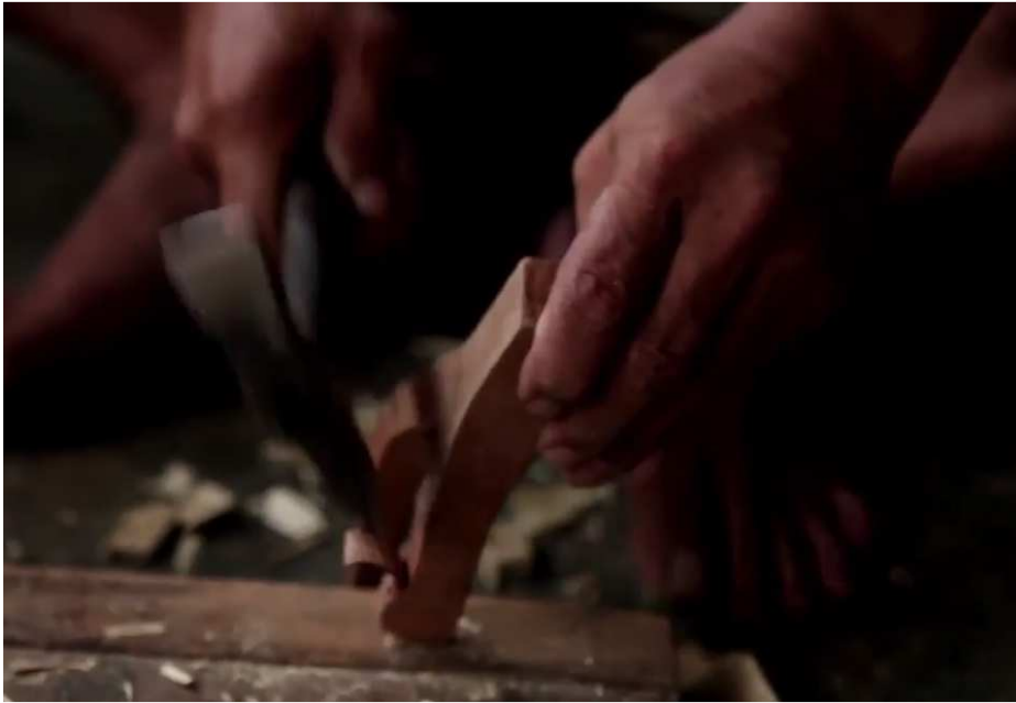
Deer "horn" of a Dambus by maker KUSYIADI, Pangkalpinang (Bangka Isl).