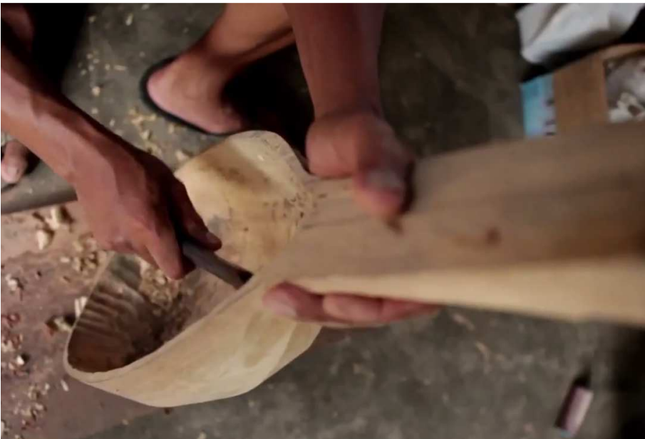
The maker KUSYADI (Desa Namang, central Bangka) while carving a Dambus box.