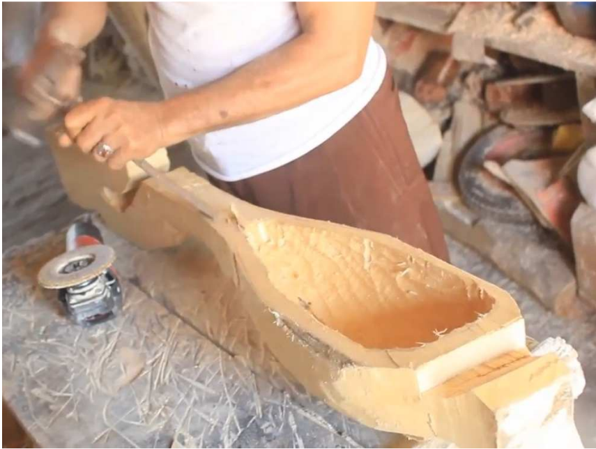
Pak ZAROTTI (Bangka) , while hollowing the soundbox.