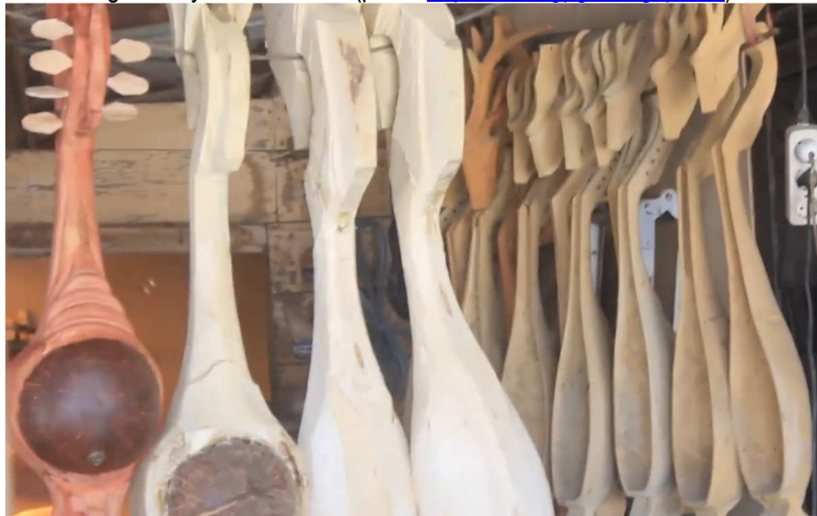
Rough boxes by maker Pak ZAROTTI (Bangka)