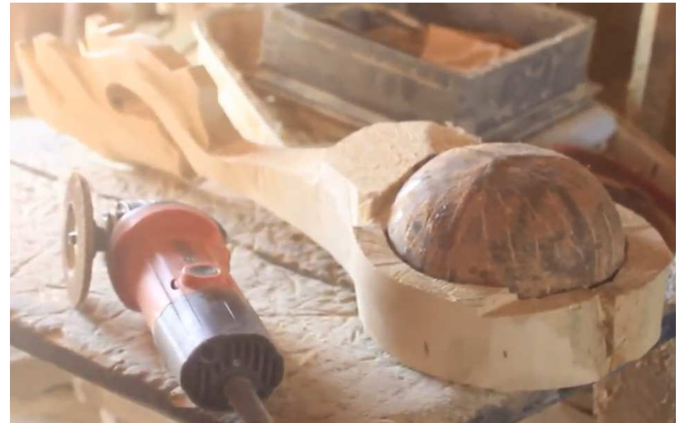
Pak ZAROTTI (Bangka) ; toy - variant with coconut shell-made box.