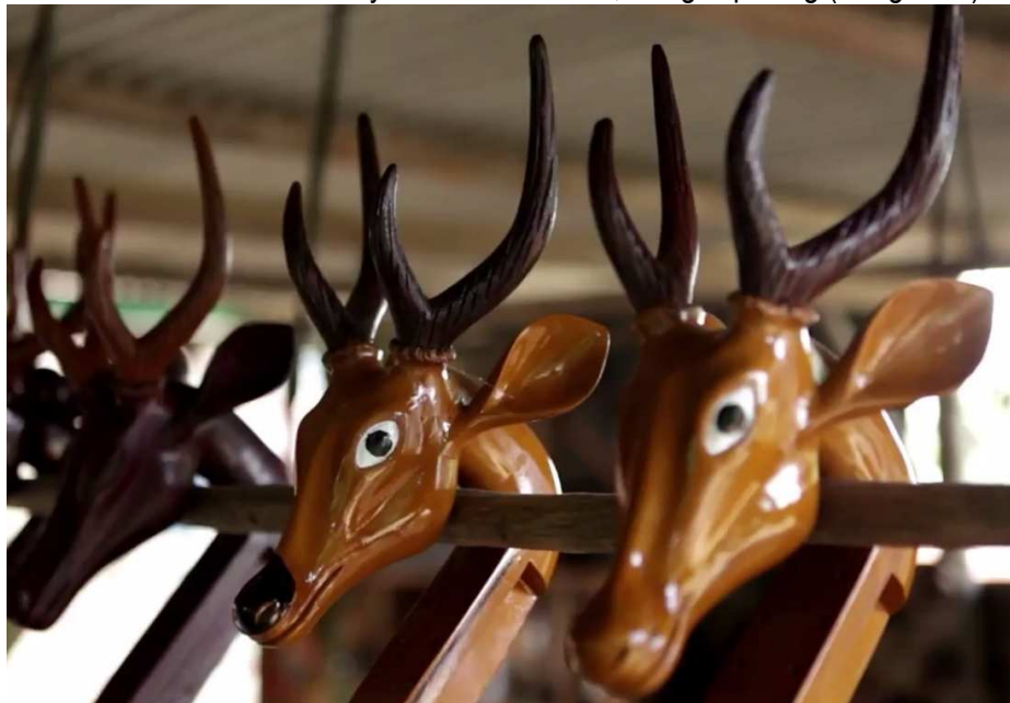
Dambus pegbox by Pak ZAROTI (Pangkalpinang).