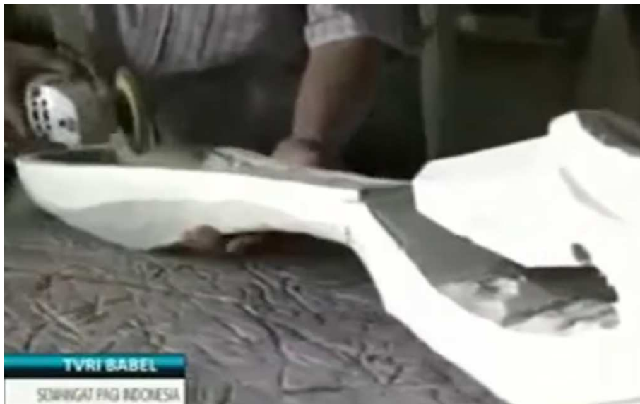
Pak ZAROTTI (Pangkalpinang) while carving the soundbox