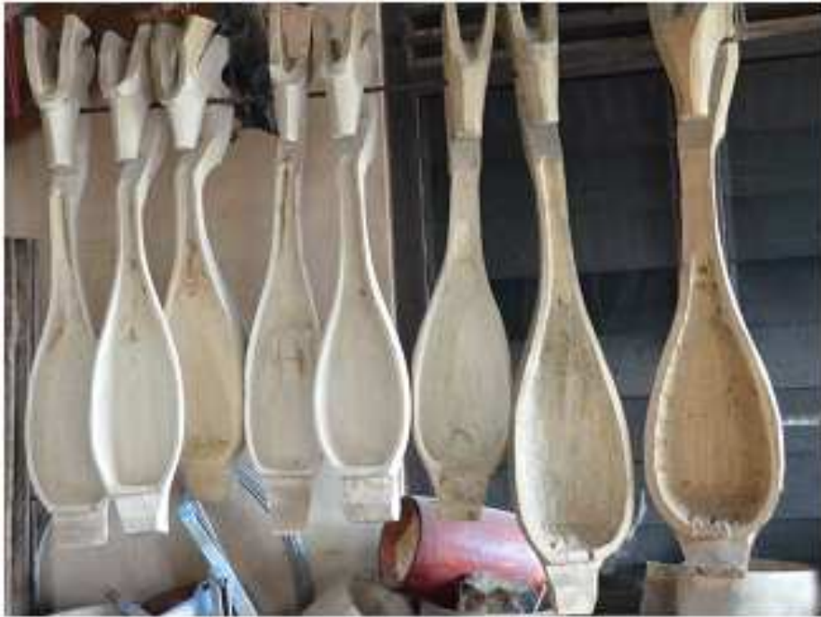
Ready boxes of a Dambus by maker Pak ZAROTI, Pangkalpinang. The neck is generally hollowed out.