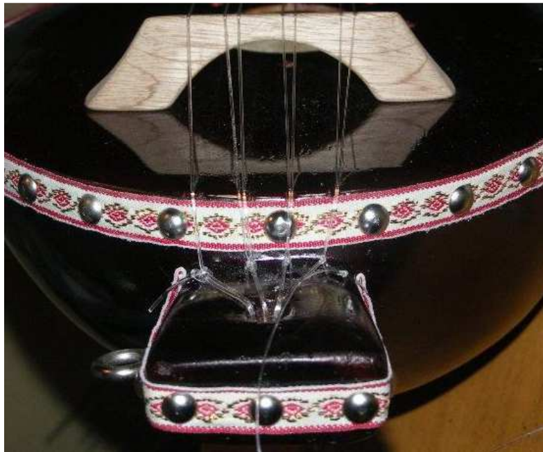
Stringholder by maker KUSUKENI (Bangka Isl)