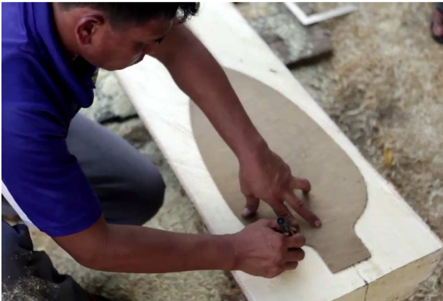
The maker KUSYADI (Desa Namang, central Bangka) while carving a Dambus box. (photo web)