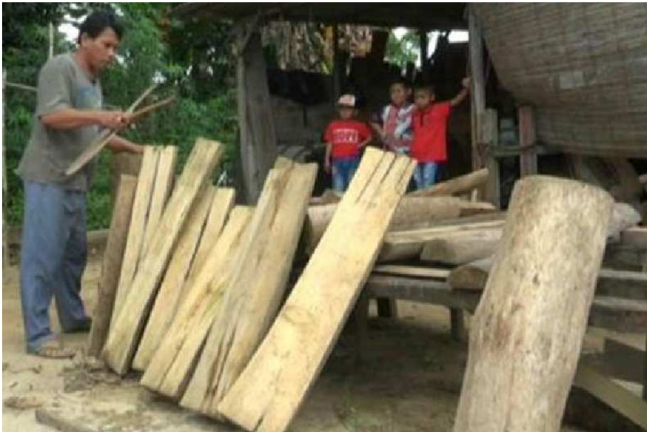
The maker KUSYADI (Desa Namang, central Bangka) while carving the soundbox of a Dambus . Note the 2 parts box.