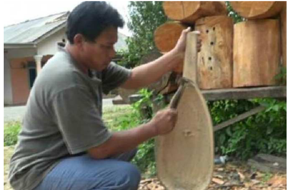
The maker KUSYADI (Desa Namang, central Bangka) while polishing the soundbox of a Dambus .