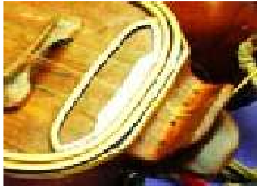
Stringholder by maker ZAROTTI (Bangka Isl)