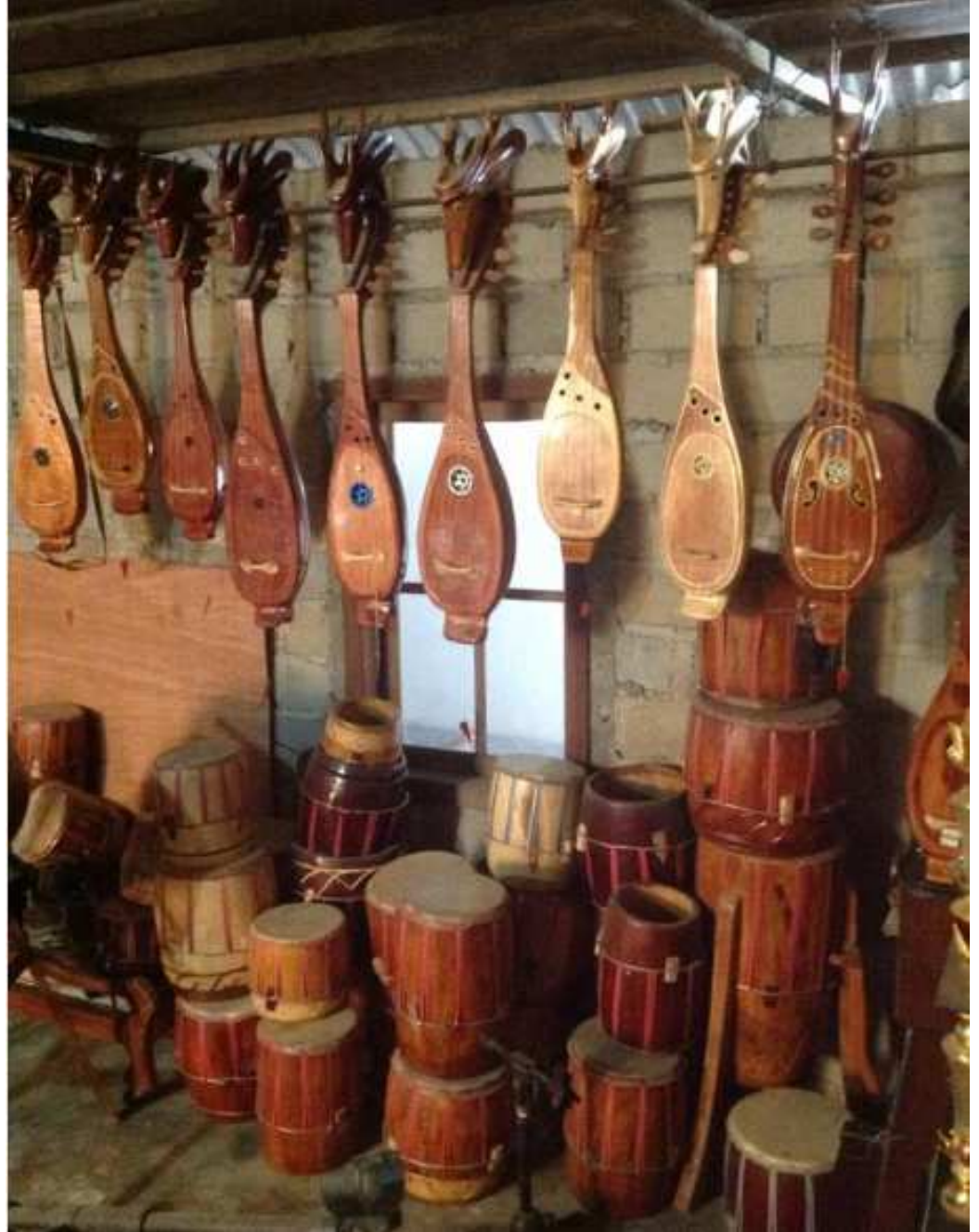
Dambus workshop of the maker Pak ZAROTI, Pangkalpinang (Bangka Isl).