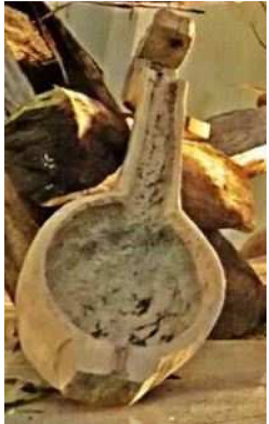
Ready boxes of a Dambus by maker PAKSU, Muntok (Bangka Isl).