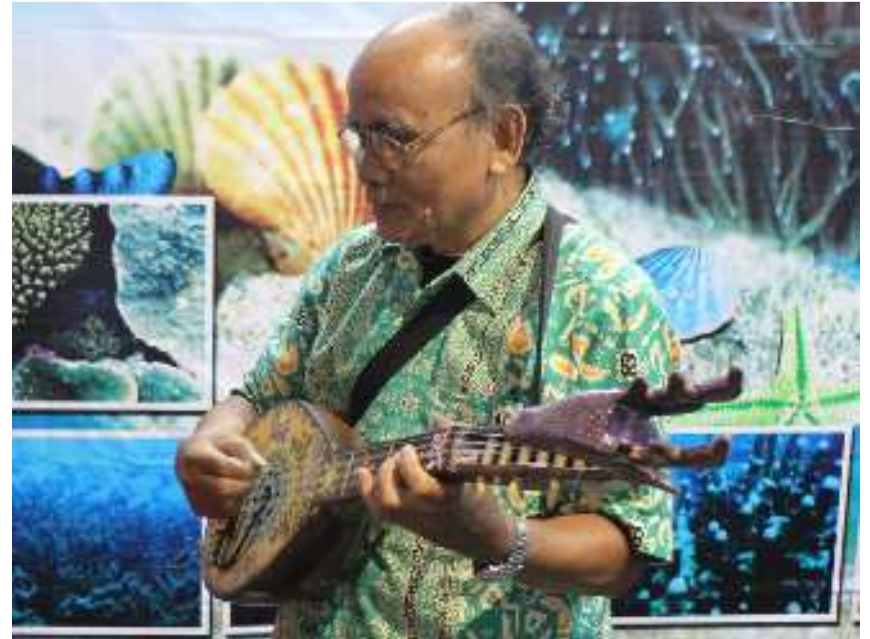
maker Ziwaid KUSUKENI (Bangka Isl)