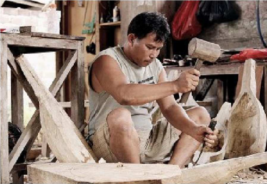
The maker KUSYADI (Desa Namang, central Bangka) while carving the soundbox of a Dambus . Note the 2 parts box.