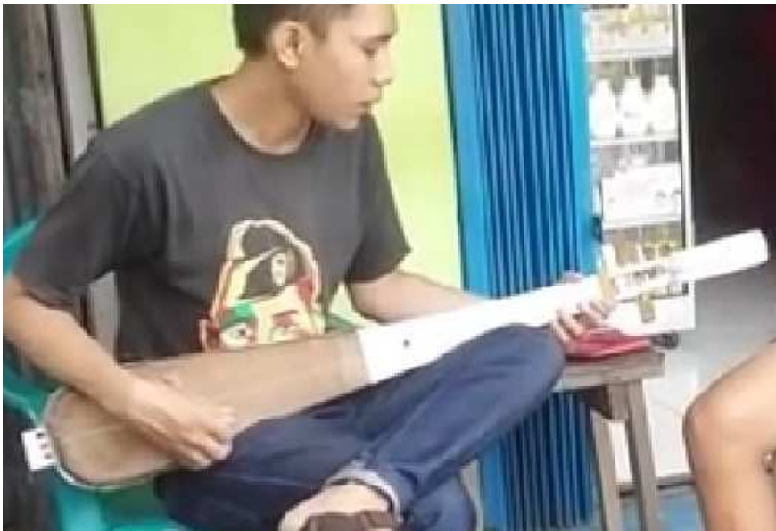
Dambus lute in Bangka