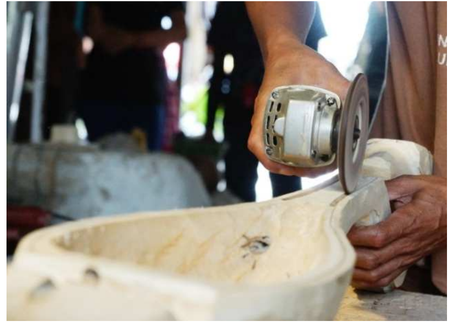
Pak ZAROTTI (Bangka) , while hollowing the neck.