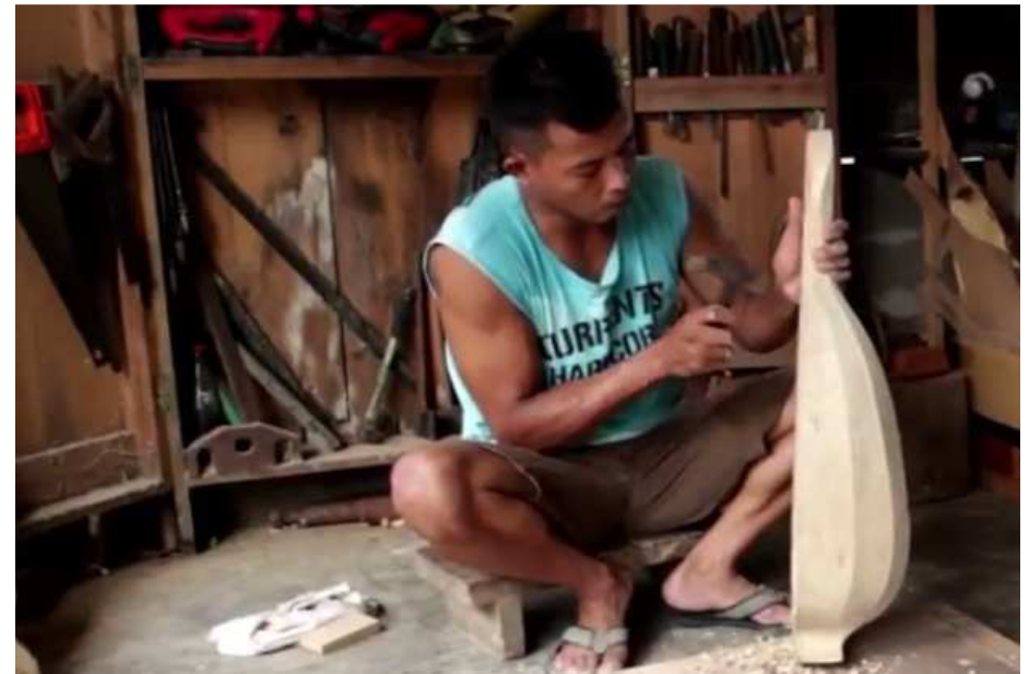
The maker KUSYADI (Desa Namang, central Bangka) while carving a Dambus box.