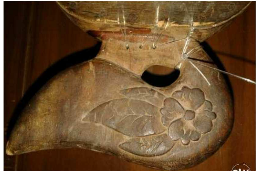
Old style Stringholder (Bangka Isl)