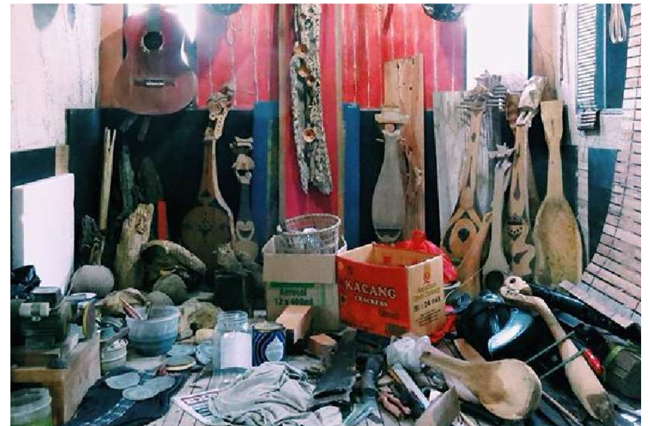
Workshop of Usni MARIOSHA (Belitung Isl)