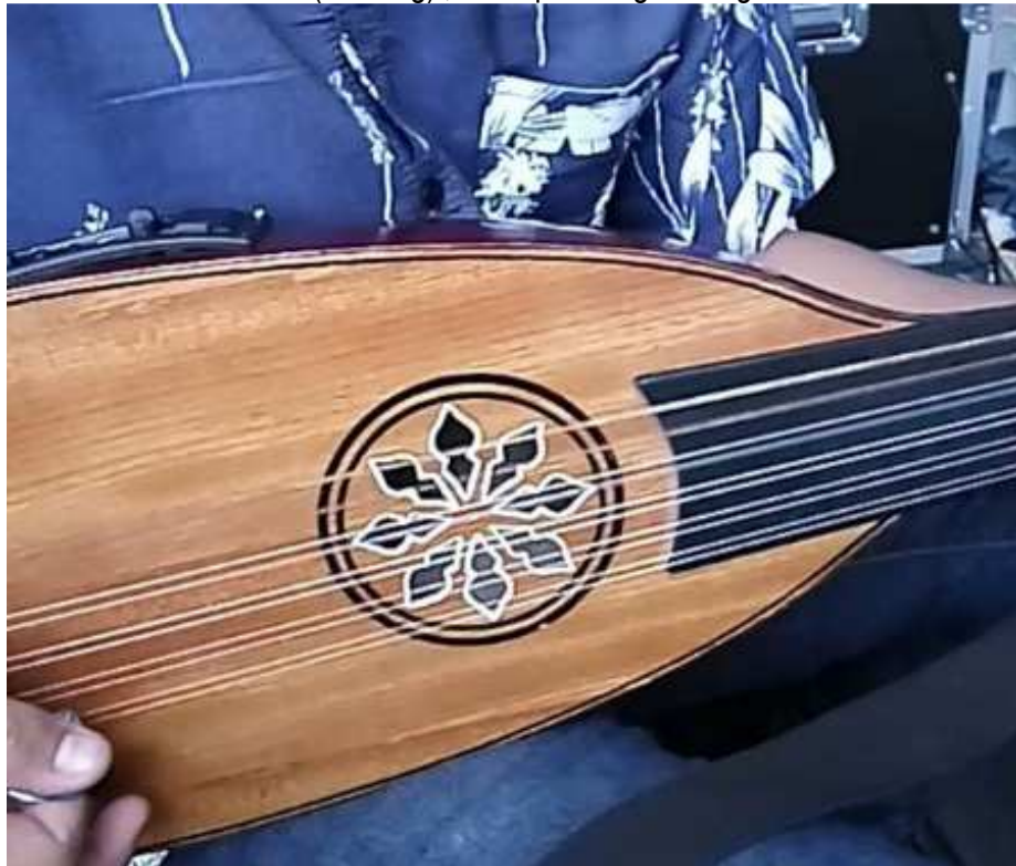
Dambus finishings by maker KUSYADI (Desa Namang, central Bangka)