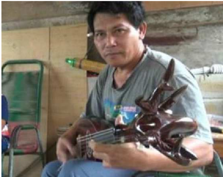
Maker KUSYIADI (Bangka Isl)