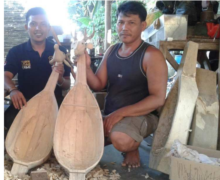
A Dambus box by KUSYADI (Desa Namang, Bangka)