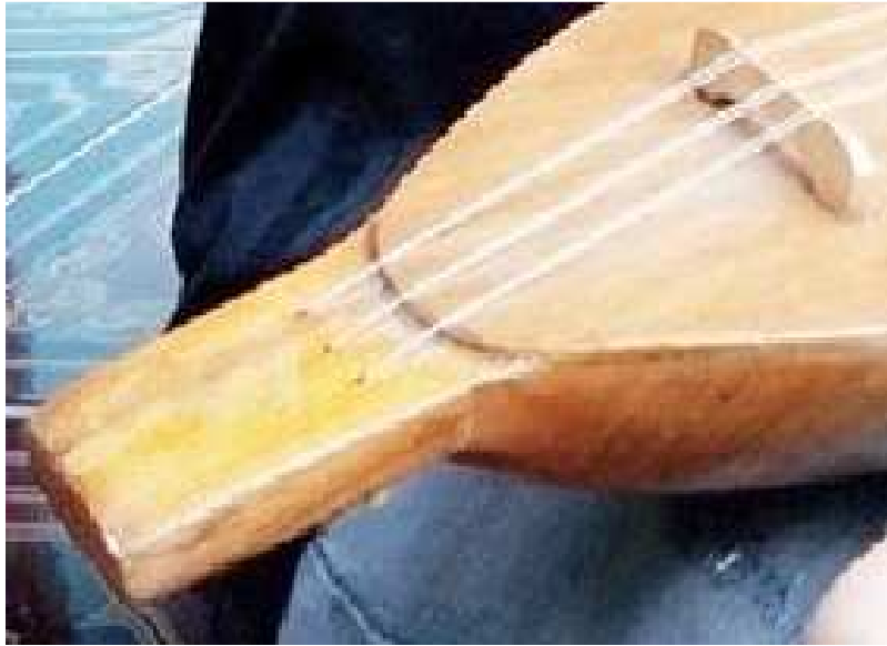
Stringholder by maker KOERA-KOERA "PAKSU" (Bangka Isl)