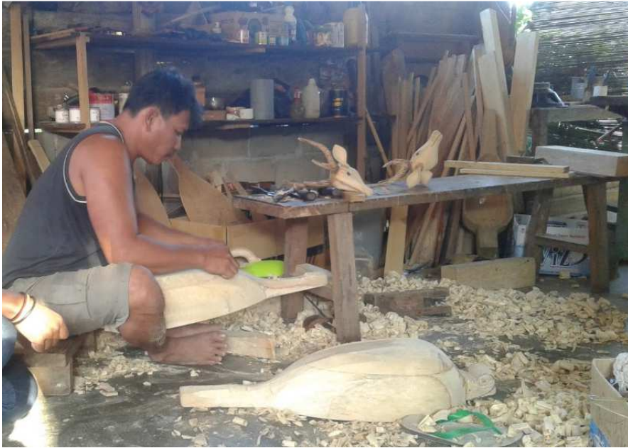
The maker KUSYADI (Desa Namang, central Bangka) while carving the soundbox of a Dambus . Note the 2 parts box.