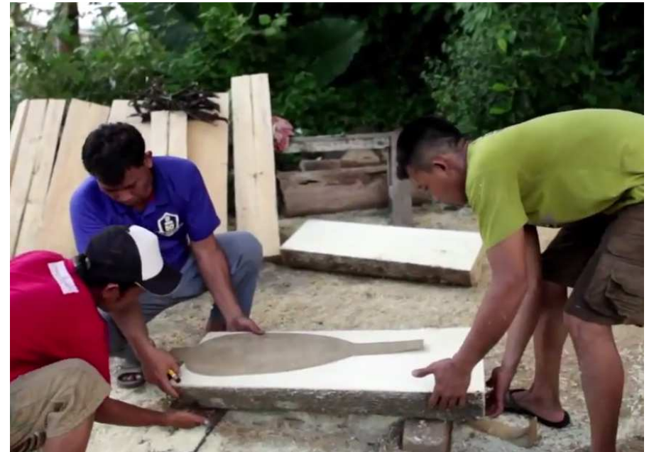
The maker KUSYADI (Desa Namang, central Bangka) while polishing the soundbox of a Dambus .