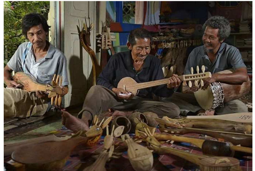
maker KOERA-KOERA "PAKSU" (Muntok, Bangka Isl)