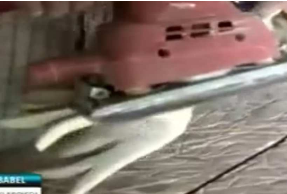
ZAROTTI (Pangkalpinang) while polishing the pegbox.