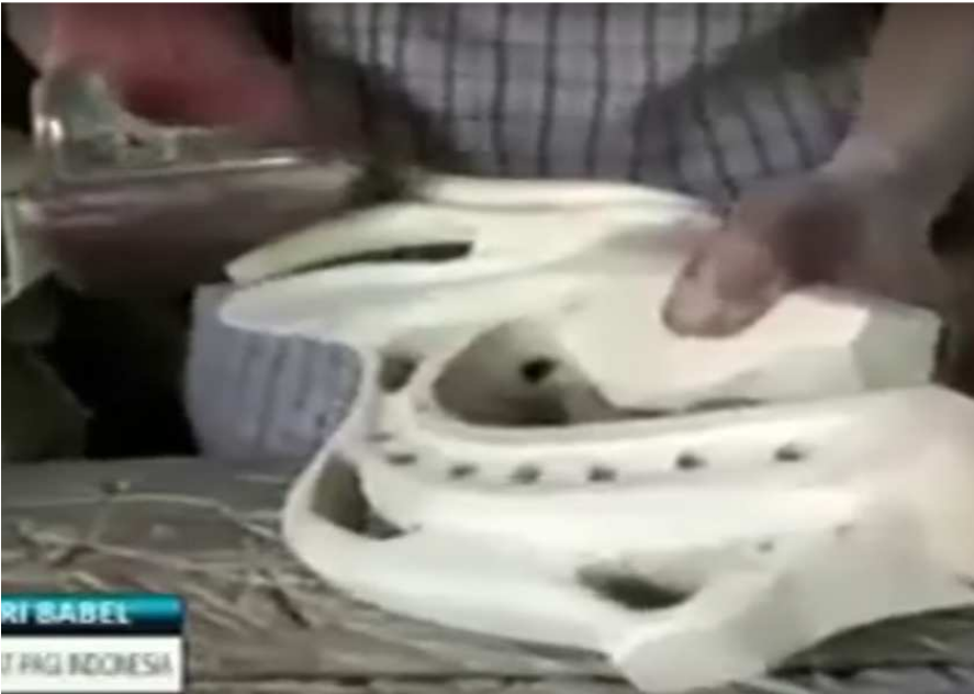
ZAROTTI (Pangkalpinang) while polishing the pegbox.